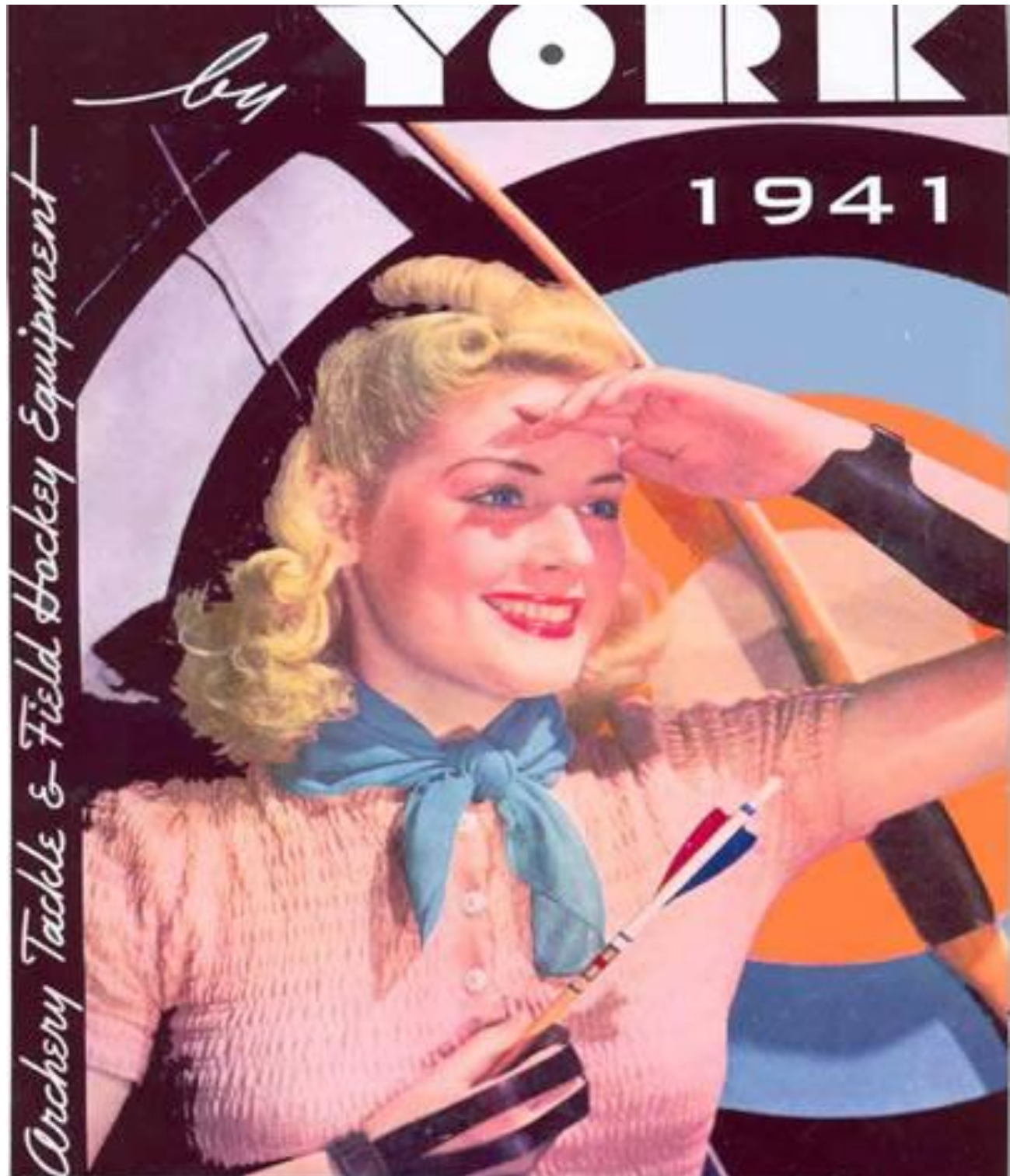
Archery and Patriotism on display on the cover of the York Archery Catalog from the World War II Era.