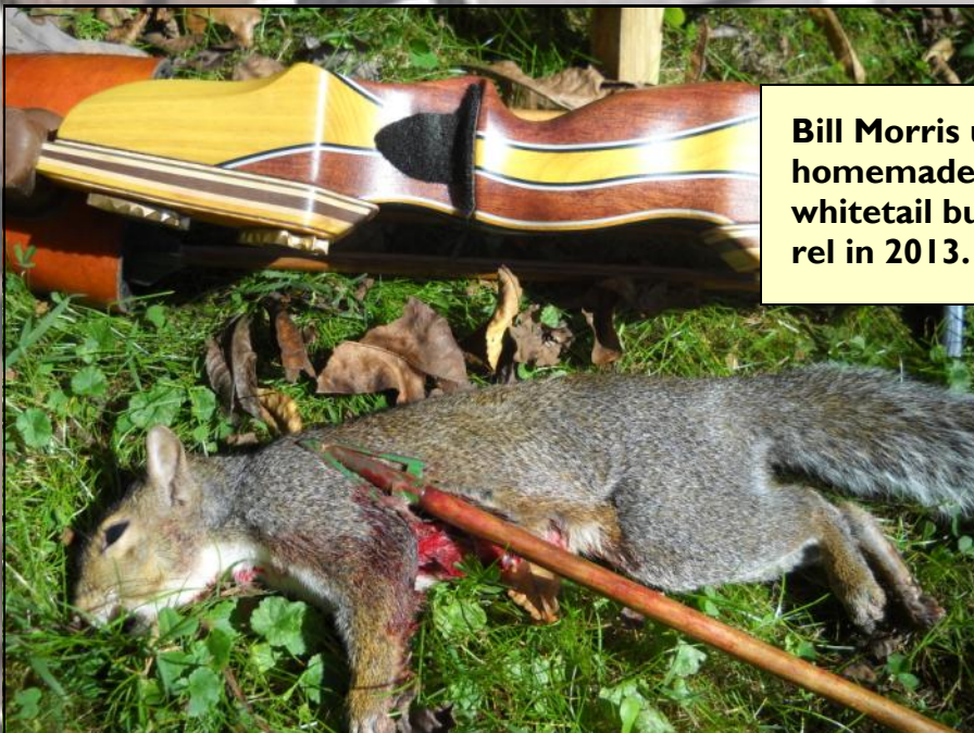
Bill Morris used this same arrow and homemade broadhead to harvest a whitetail buck in 2012 and this squirrel in 2013. Wonder what's next?